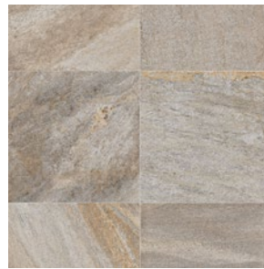
v4 ORSI SK 06 ST