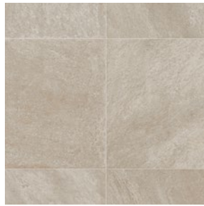
v3 RESIA SK 02 ST