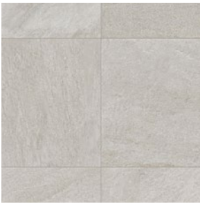
v3 BRAIES SK 01 ST