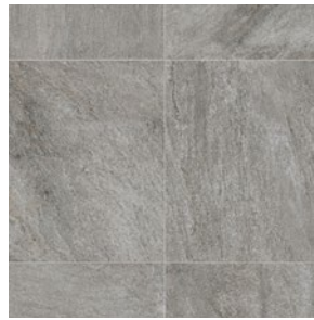
v3 MORITZ* SK 03 ST