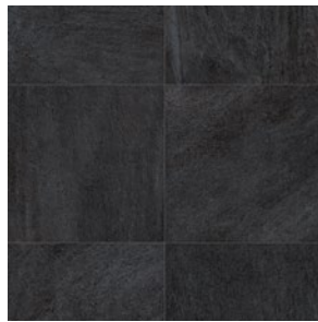
v3 MORO* SK 05 ST