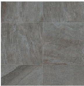
v3 NEMI SK 04 ST